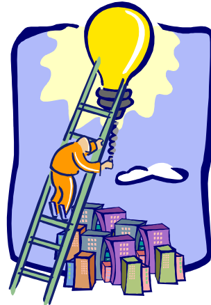
School Counselors: Helping Students Reach New Heights

Mon., Feb. 5- Balloons. Students will receive a balloon that will serve as a reminder of how school counselors "help students reach new heights."